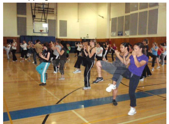
*Please Register Early to save your spot; these events fill quickly

You will learn to be prepared to face hostile situations, including physical/sexual assaults, and attempted kidnappings.